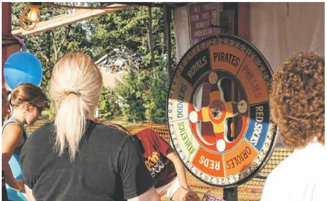
Try out your luck at Anderson Days with a variety of gambling games.