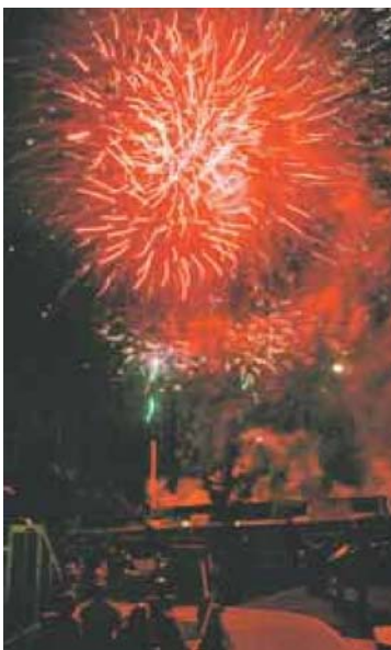
The fireworks show is one of the best in the area.