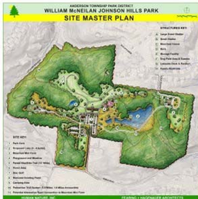
This is the Anderson Township Park District's master plan for the development of Johnson Hills Park.

There was some discussion about moving the lake to another area of the park, but nothing was decided.