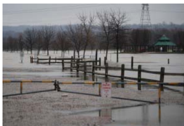
Flood waters in early March cover Clear Creek Park, off state Route 32. The Anderson Township Park District recently bought a neighboring property to mitigate flooding in the park.